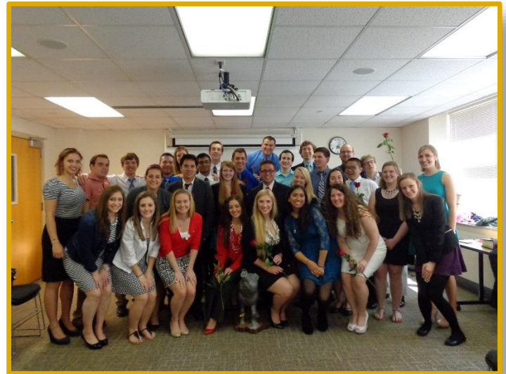
Spring 2014 Formal Initiation

We are pursuing this by suspending and our ghost members as well as using GroupMe for quick reminders. This semester we sent five actives, including myself, to the regional convention in Detroit, Minnesota. I hope to attend the regional conference in Lawrence, Kansas in April as well, since it is a much closer drive. The brothers came back from the regional conference with the idea of having a lock in for the chapter. A committee has been formed and plans are now being discussed for our first retreat in the beginning of the Fall 2014 semester. The chapter would also like to start a scholarship for incoming engineering freshman