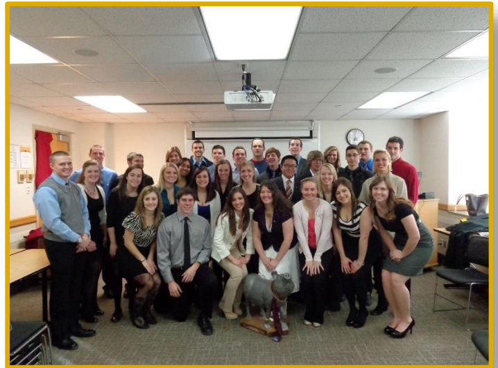
Fall 2013 Formal Initiation

improved over the semester. I cannot take any of the credit for this though. All I did was give the vision I had to the rest of the Officers and Brothers and they are the ones that made it come to fruition. I feel we are a stronger, more tight knit fraternity of brothers than I had ever felt while in Theta Tau.