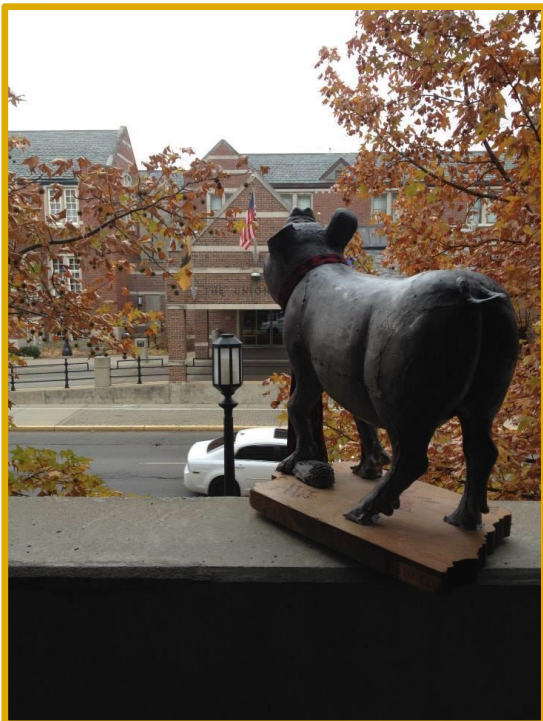
Arnold leaving Purdue