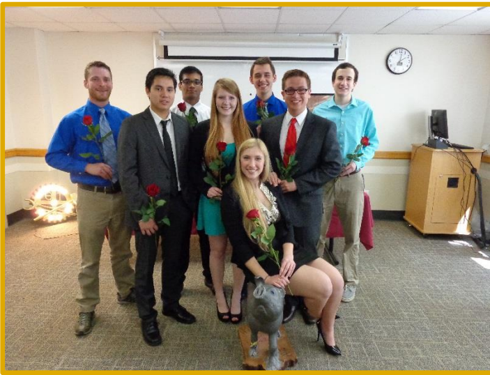
Spring 2014 pledge class

know more about Theta Tau and the opportunity it has to offer.