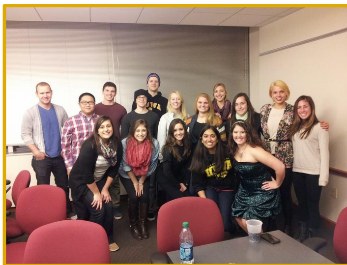
Pledge event 2013

This rush/pledge semester started off with two weeks of Rush events to get to meet new potential members and tell them about what Theta Tau is and what we do as a chapter. These events included a pizza party, an informational session, Frisbee and lawn games, and a Buffalo Wild Wings dinner. Once we met the potential members and determined their interest and potential assets to the fraternity, bids were delivered.