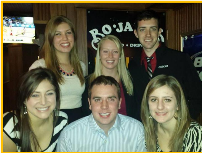
Fall 2012 Pledge Class

be excited to be appreciated by the Chapter. The final thing that I feel was a big positive this semester was the four pledges that we initiated in January. All four of them bring a unique view to our Chapter and I feel that at least two of them will be a future Regent if they so choose. It was not a large group but I feel it is definitely a highly motivated group and will not be a group known for its "resume builder" Brothers.