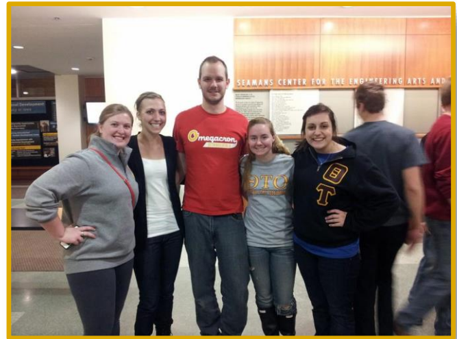
E-week competition team

Next to really get people to meetings by wanting to show up, there was instituted a couple of things. First off we implemented an “Ice Breaker” at the beginning of every meeting. This allows us to interact with each other in different ways and build a better bond