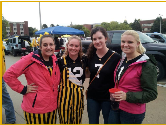
Hawkeye football game

First of all our chapter was not following the chapter Bylaws pertaining to meeting attendance. In the bylaws there is a tier and fine system in place. This essentially made it mandatory for everyone to attend certain events and only miss a certain amount of others without excuse. This was implemented mainly to show that we are going to the basics and actually doing what we actually should be doing.