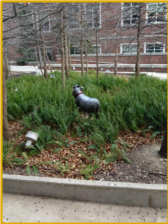
Arnold getting back in touch with nature